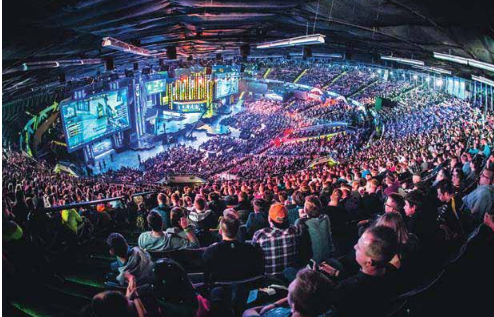
CS:GO was played in front of 113,000 fans in Katowice, Poland, from March 2 to 6.

IN MAY 2015 , Chris Grove started noticing the heavy traffic on CSGO Lounge.